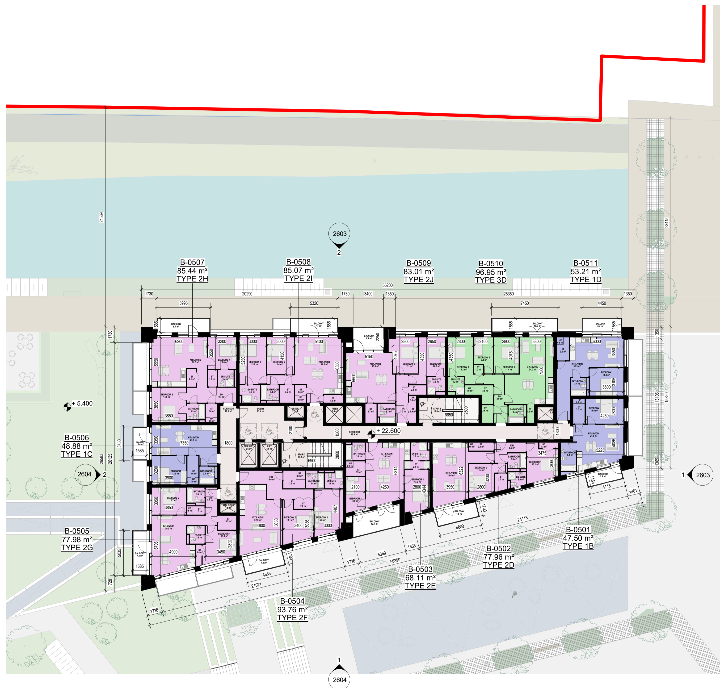
Accommodation Schedule-BLOCK B_L05